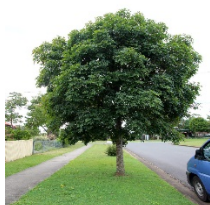
Crows Ash Flindersia Australis Grows 20+m