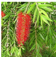
Red Bottle Brush Callistemon Grows 3-4m