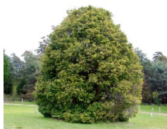
Blue Lilly Pilly Acmena Smitii Grows 3-5m