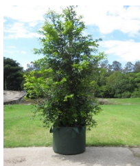
Lilly Pilly Syzgium Resilience Grows to 5m