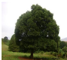
Native laurel Cryptocarya Grows 20+m